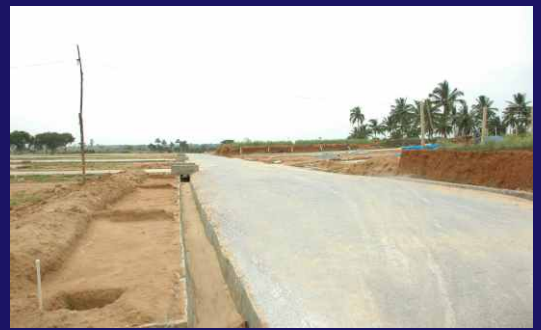
Vinsco Blossoms (V. B. Enclave)