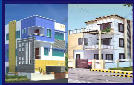
V. G. Individuals II