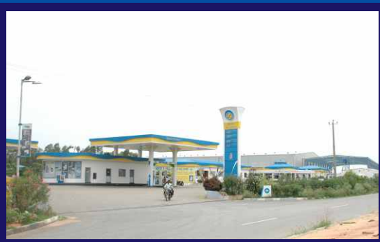
Latest Development near Project

As a fair opportunities for the first 400 investors, we are giving 10 years resort membership as a complimentary which can be renewed with nominal charges.